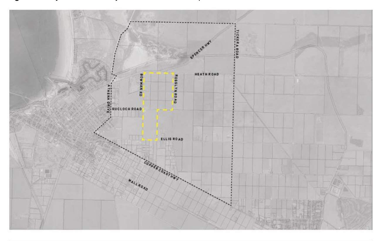
Figure 4.2 Adjacent and nearby land owners and occupiers